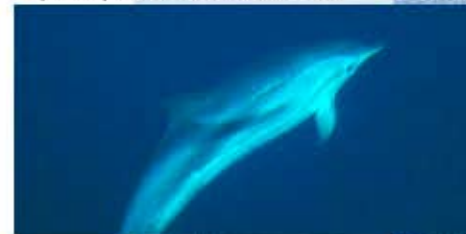
Striped dolphin ( Stenella coeruleoalba )

It's a small species that inhabits tropical and sub-tropical off-shore areas of all the oceans and seas. In Mediterranean it is the most abundant dolphin, whilst in the Adriatic it is only rarely seen. It has natural predators - sharks and killer whales, but the biggest threat comes from humans. They are often accidentally entangled in gill nets set for tuna and sword fish. Habitat degradation and over fishing, which has narrowed their source of food, together with pollutants such as organo-chlorines, which weaken their immune system, present a clear threat to their survival in nature.