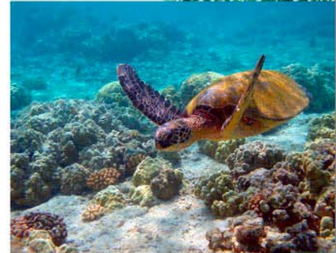
Green sea turtle ( Chelonia mydas )

Unlike other sea turtles, green sea turtles are herbivorous. They feed on sea-grass and algae which make their fatty tissue appear greenish, hence the name. Although world-wide distributed they visit Adriatic only occasionally. In appearance they resemble loggerhead turtles but can be distinguished by number of lateral scutes on their shell - green sea turtles have 4 lateral scutes while loggerhead turtles have 5.