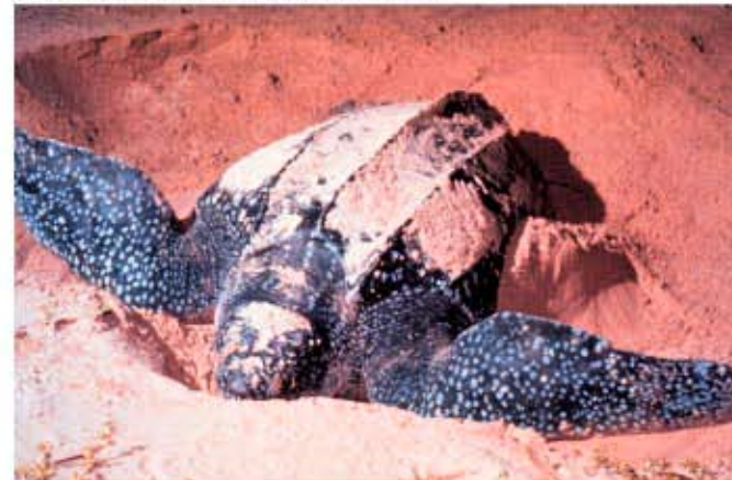
Leatherback sea turtle ( Dermochelys coriacea )

This is the most common turtle species in the Adriatic sea. Loggerhead turtles found in the Adriatic are part of the Mediterranean population that nests on the beaches of Turkey, Cyprus and Greece. After years spent in the open seas and upon reaching sexual maturity they come to the northern Adriatic. Availability of turtles' favorite diet - squid, mollusks, starfish, sea urchin, crabs, sponges as well as the shallow, muddy sea bottom makes the northern Adriatic appropriate feeding and hibernation area for sea turtles. Loggerhead turtles can grow more than 2 meters in length and weigh more than 200kg. This species is commonly called the "loggerhead" sea turtle due to their overly large heads and a thick, horny beak.